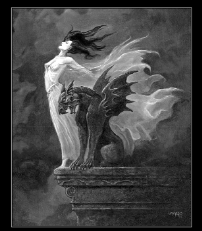
THE GOTHIC FANTASY ARTWORK OF JOSEPH VARGO